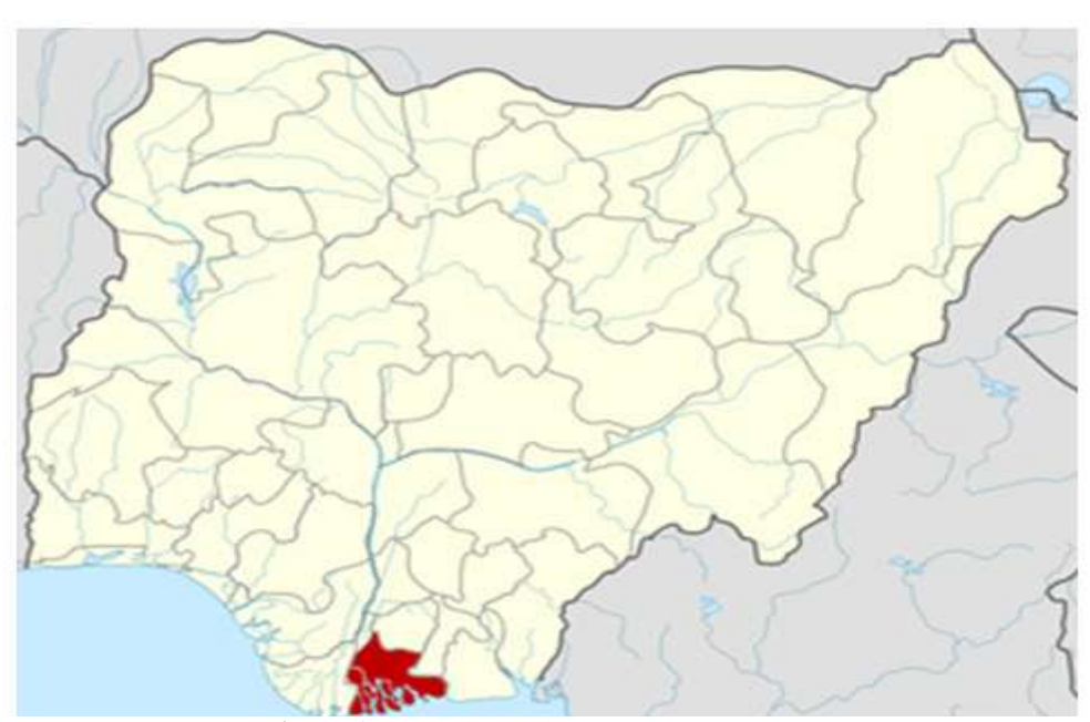
Figure 1: Map of Nigeria showing Rivers state.